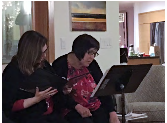
People schmoozing at the after-party.